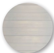
Aluminium anti-slip platform