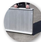
Four wheels and two handles for easy transport