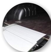
Adjustable floor contact flap