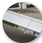
Safety edges (5 cm)